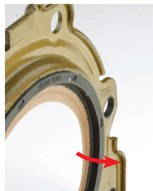
Figure 1 _Sealing lip faces the transmission

Be sure to follow the PTFE oil seal installation instructions included in the kit.