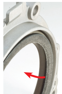
Figure 2 _Sealing lip faces the engine interior