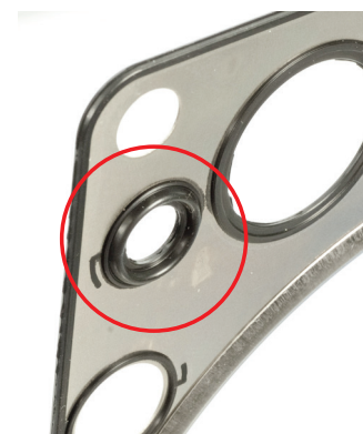
61-37770-00_3 mm higher rubber gasket lip