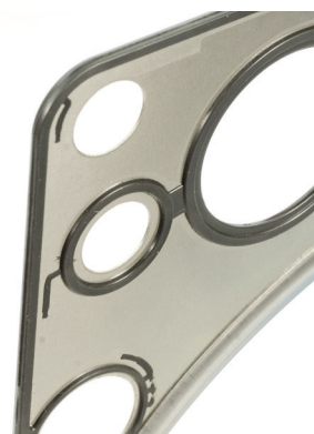
61-34285-20_Even rubber gasket lip