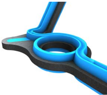
Figure 2: Primerless connection between sealing frame and elastomer

The technological highlight of the electronic connector gasket is that it is first media-impermeable connection between an elastomer and a thermoplastic sealing frame made of polyamide for an optimized bond. The firmly bonded connection between the two surfaces does not require any additional primer and provides unimpaired oil resistance and impermeability. Dana procures the polyamide and the elastomer's base components for the "primerless" connection directly from thermoplastics manufacturer DuPont.