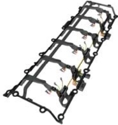
Figure 1: Victor Reinz Electronic Connector Gasket